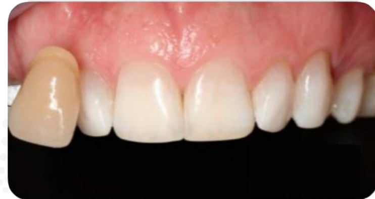
Ten Orthodontic Centre Patient